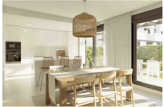
Dining area (Rendering)