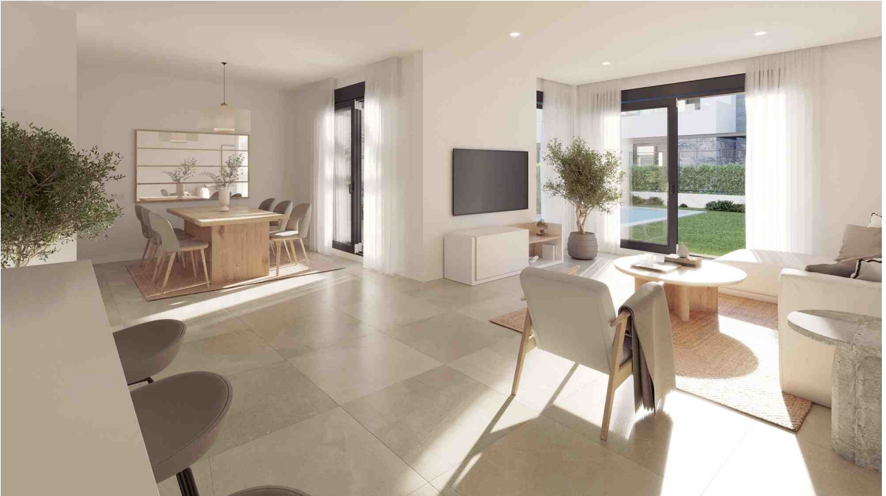
Dining area (Rendering)