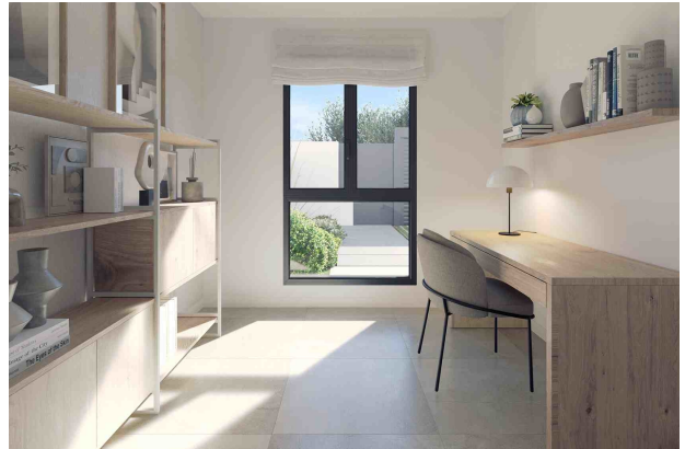
Office / 4th bedroom (Rendering)