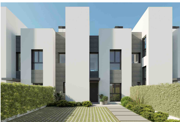
Parking / Entrance (Rendering)