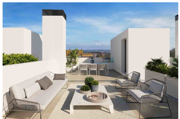
Roof terrace (Rendering)