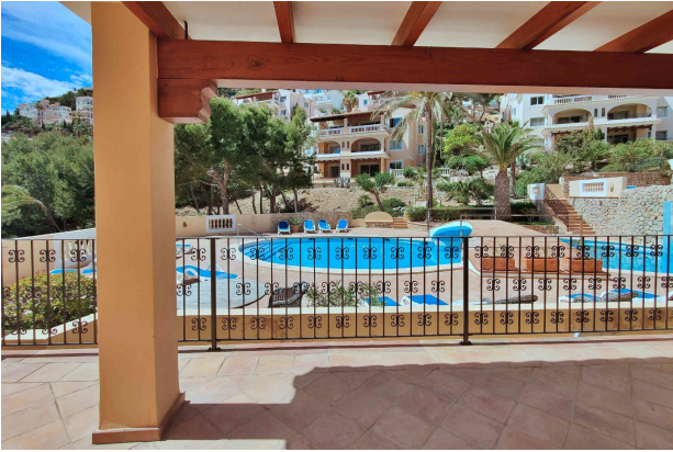
Terrace (Swimmingpool view)