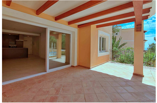
Terrace (partial sea view)