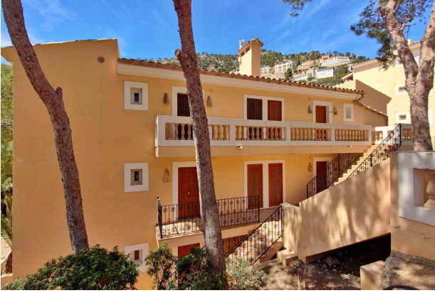
Building / Entrance