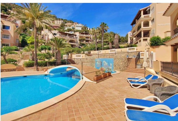
Terraces with sunbeds (Community)