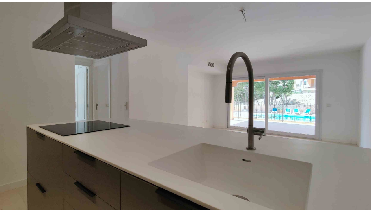
Kitchen / Living