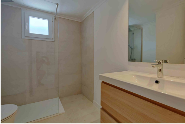
Bath 1 (en Suite)